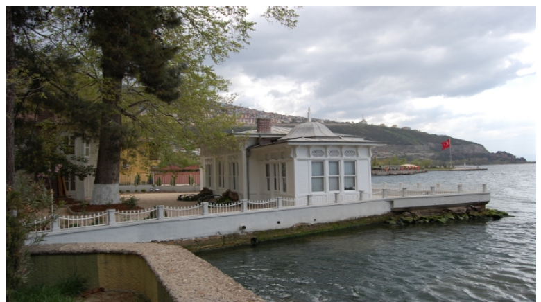
Emperor Kaiser Wilhelm II Palace (K rfez-Kocaeli, TURKEY)