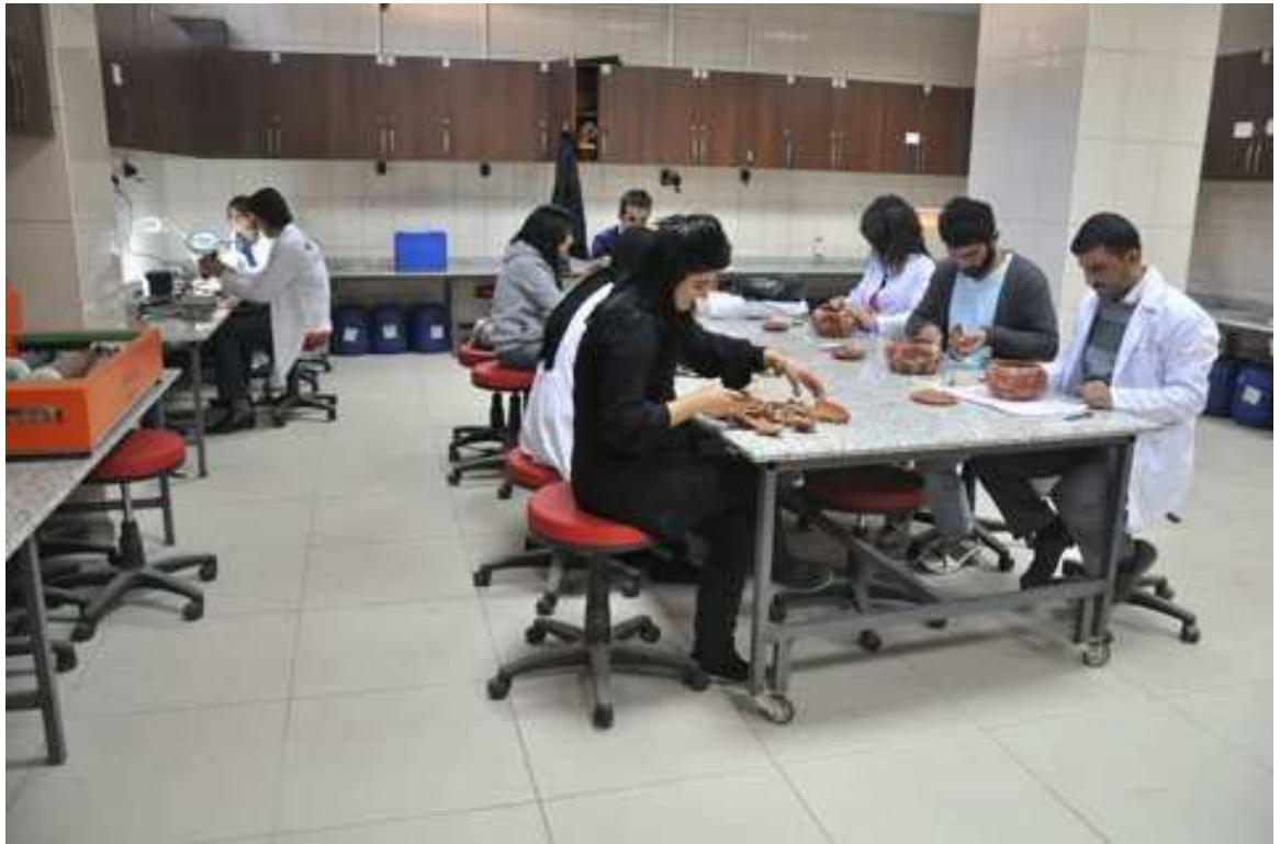
Picture 1: Performance of applied course in the laboratory of the Department.