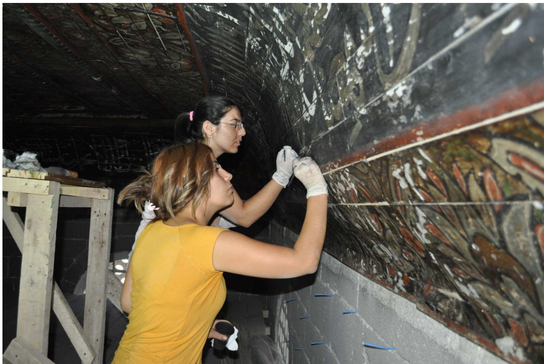
Picture 3: Restoration of Diyarbakır Ulu Mosque, performance of applied course.