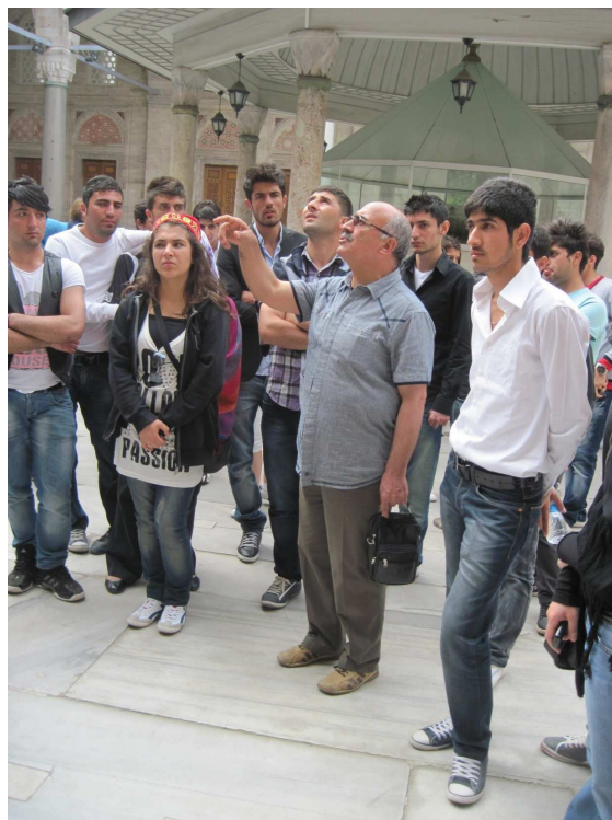
Picture 6: Course of introduction to the Immovable Cultural Properties