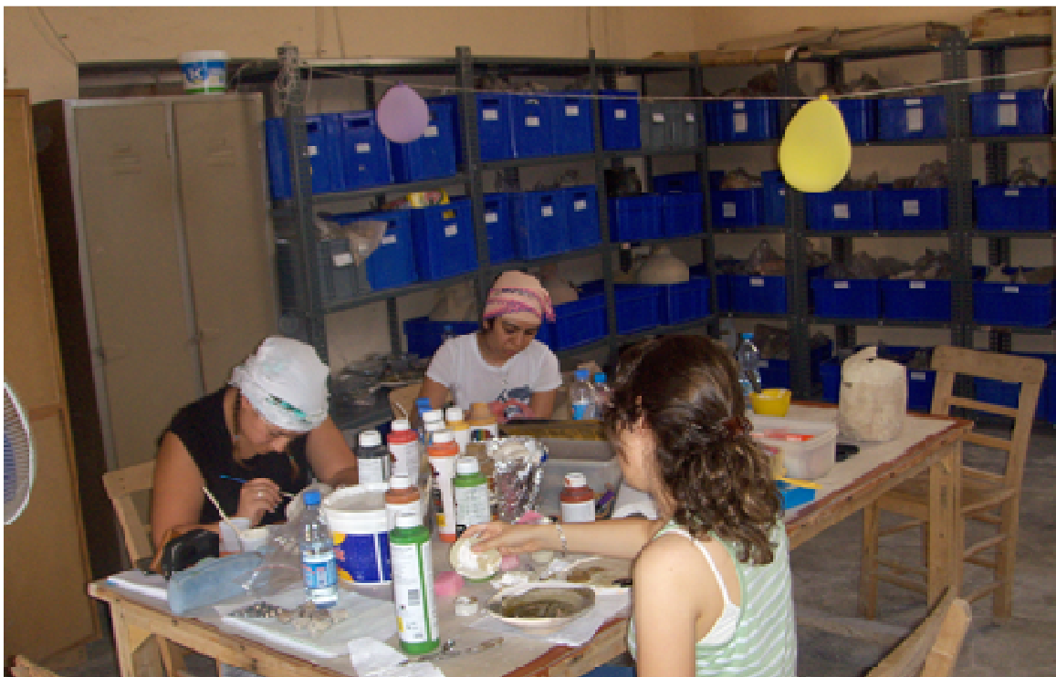
Picture 2: Performance of applied course in the Hasankeyf Excavation House laboratory.