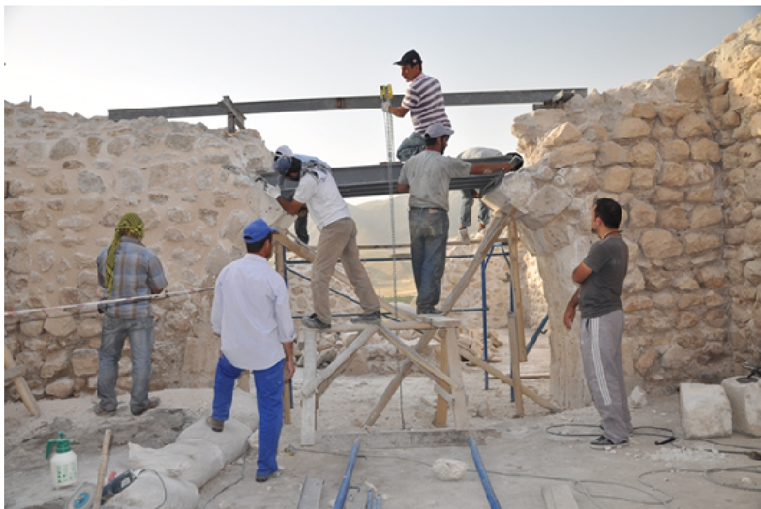
Picture 4: Restoration of Hasankeyf Büyük Saray (the Great Palace), performance of applied course.